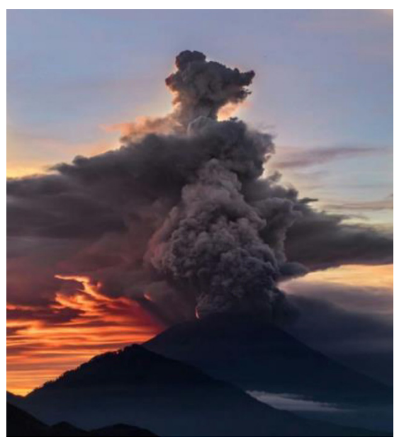
Figure 4 thick smoke soared approximately 1500 meters from its peak<sup>4</sup>

Moreover, the volcanic ashes resulted in various