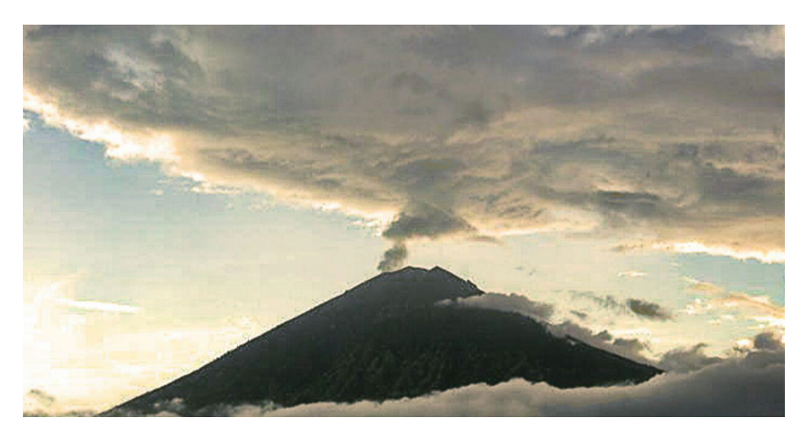
Figure 1 It has been 54 years passed. Now, the volcano is in its turmoil <sup>4</sup>