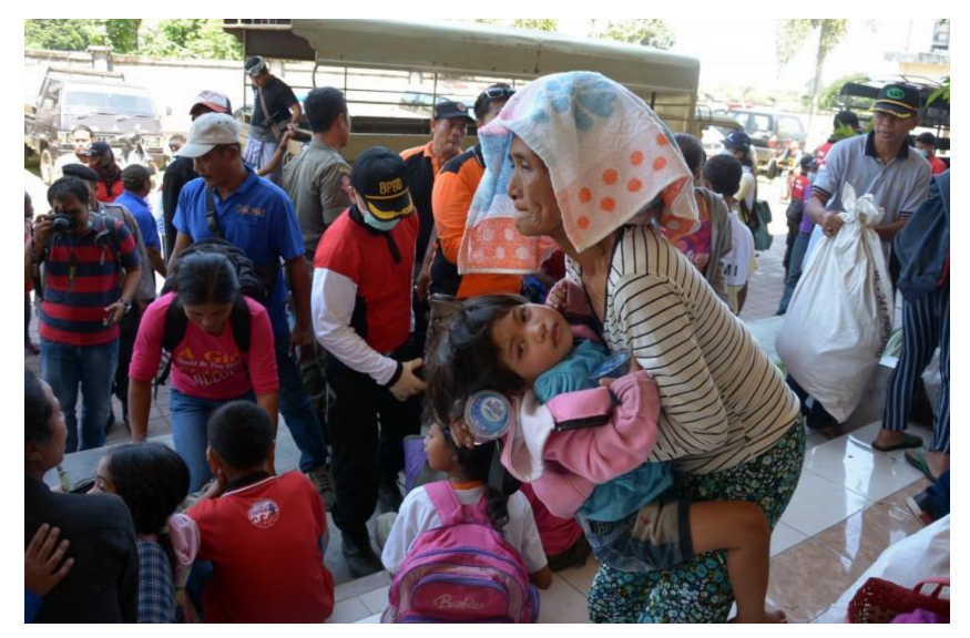
Figure 2 The locals who live within 9 - 12 km zone from the crater have been secured. The refugee is estimated to reach 57,428 people, spread across 357 points on nine regencies in Bali <sup>10</sup>

The distribution of refugees was respectively in Badung regency, 328 people, Bangli Regency 4,690 people, Buleleng Regency 8,518 people, Denpasar City 2,212 people. 137 people on Gianyar Regency, Jembrana Regency, 82 people, Karangasem regency 21,280 people, Klungkung regency 19,456 people, and Tabanan regency, 715 people.