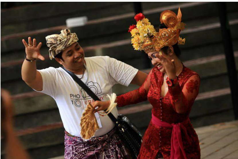
Figure 1 Joged Bumbung, one of Bali's balihaan dance, acts as social dance as well as entertainment 2

According to Marlowe, several strategies may be implemented to prevent further repeatable incident via offline and online. Officially, the Culture Department needs to identify and counsel