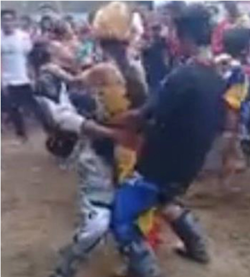
Figure 2. performance of joged bumbung dance along with the pengibing. The fuss is about the behavior of the pengibing which is considered excessive. They hugged the dancer from front and back, then moved their bodies like they were doing sexual intercourse 6