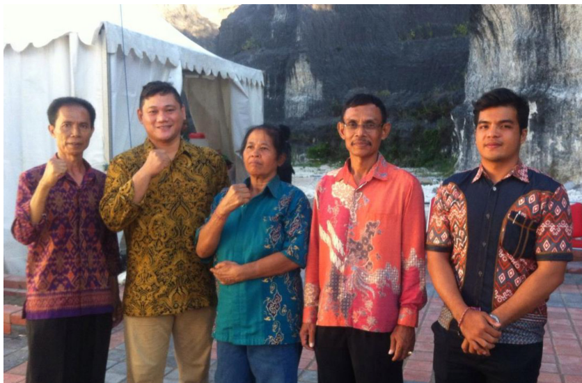
Figure 4 On occasion, PPS Betako Merpati Putih, Branch Denpasar became one of sports training centers in Bali that had the opportunity to receive appreciation from PT Telkom Indonesia Tbk 14

has been educated to learn breathing, which is related to power, vibration, or commonly known as inner power,” Kiana said. Facts on the ground, the student at a certain level, may have the ability to provide treatment. 13