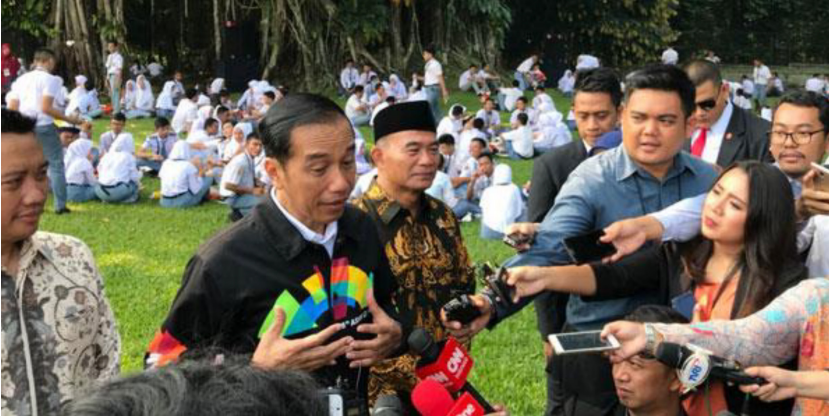
Figure 1 President Jokowi in one of the interview 3