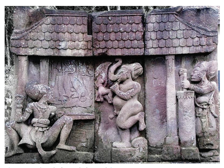
Figure 3. The relief on Sukuh temple<sup>8</sup>