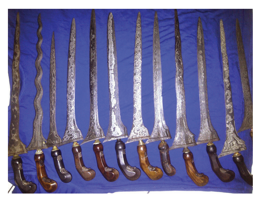
Figure 1. Keris has a distinct wavy shape on its blade, but there is also a straight-shaped keris<sup>6</sup>