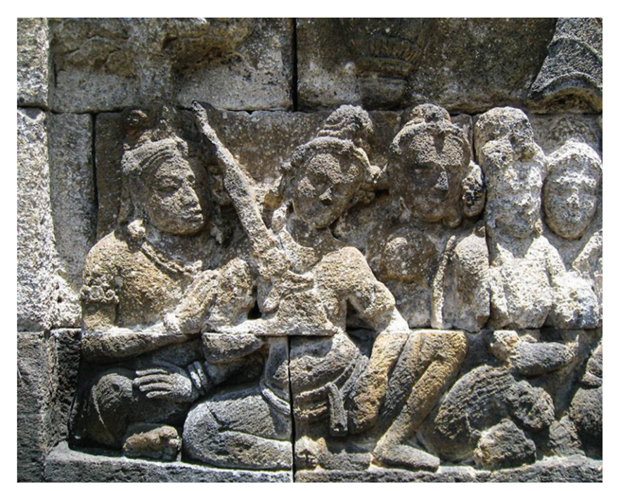
Figure 2. Southeast relief of Borobudur Temple<sup>8</sup>

knife with particular techniques passed from their predecessor. Old fashioned method to improve the metal solidity was by dipping the blazing steel to a particular chemical liquid until it coated thoroughly. However, this practice resulted in a weapon to have a thick outer but remain fragile on the core. Hence, it is preferable to be used as finishing rather than to strengthen the blade. The second technique