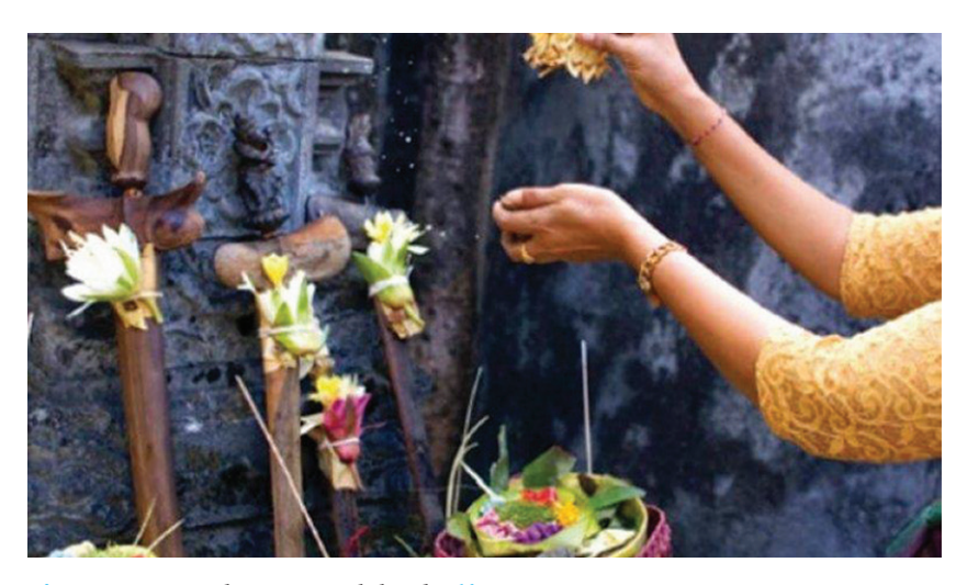
Figure 5. Ritual on Tumpek landep<sup>16</sup>

conducted in a sacred area for the holy Keris. After the cleaning process, the Keris will be coated with coconut oil mixed with fragrance oil.<sup>15</sup>