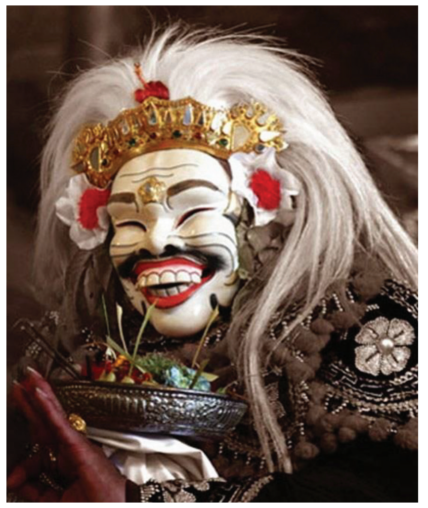
Figure 1. Topeng Sidakarya 5