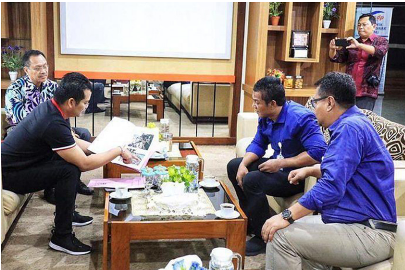
Figure 4. A Meeting between Jembrana Vice Regent and ASDP executive Officers 16

approved five new toll roads to be built on the Island of the Gods. The five toll roads are Gilimanuk-Denpasar, Gilimanuk-Tabanan, Tabanan-Kuta, Kuta-Padang Bai, and Kuta-Tanah Lot. 13