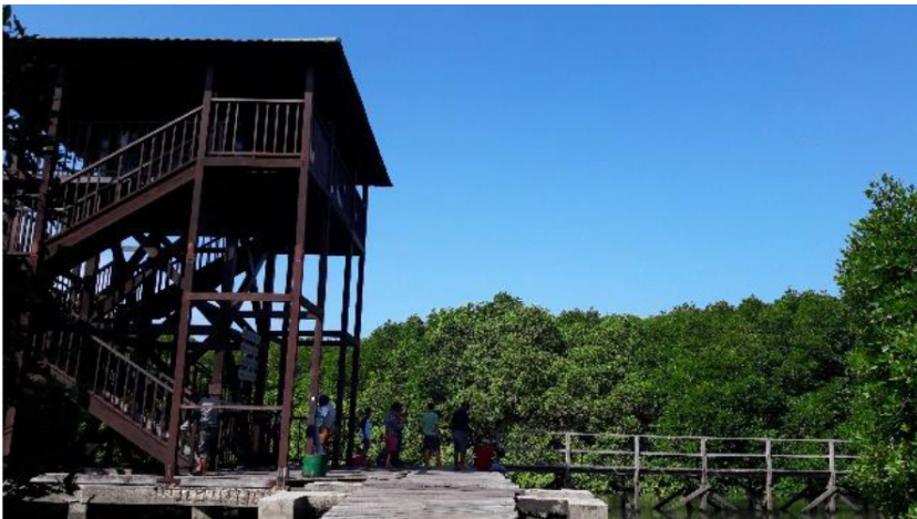
Figure. 2 The tower can also be a place to rest 2

But for a visit to Nusa Lembongan, of course, you have to ride a fast boat from Sanur beach pier to Nusa Lembongan.