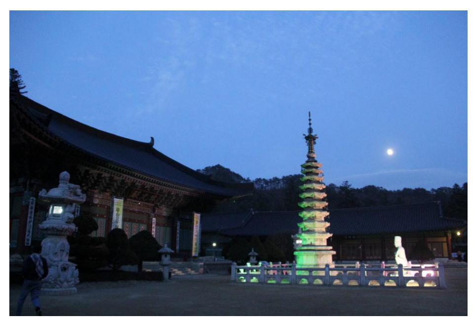
Figure 3. Octagonal nine-story Stone Pagoda (National Treasure No. 48).

Located at the entrance of Odaesan National Park, Woljeongsa Temple is one of the most famous temples in Gangwon Province. Gangwon province is the third most visited destination according to Korea National Tourism Survey 2015.5 Approximately about 2.5 hours driving to the northeast of Seoul. The history mentioned that a famous Vinaya Master from the Silla Dynasty named Jajang Yulsa built the woljeongsa temple in 643. Jajang Yulsa was a taeguksa or the Great Noble Priest of Shilla.6 At first, woljeongsa was just a simple hermitage. Today, the number of buildings on Korea's most important religious sites consists of more than 20 temples, 22 pagodas, and eight monasteries. Surrounded by hills, mountains, and hiking trails, it seems to support this place as a tourist destination that offers peace to anyone who visits it.