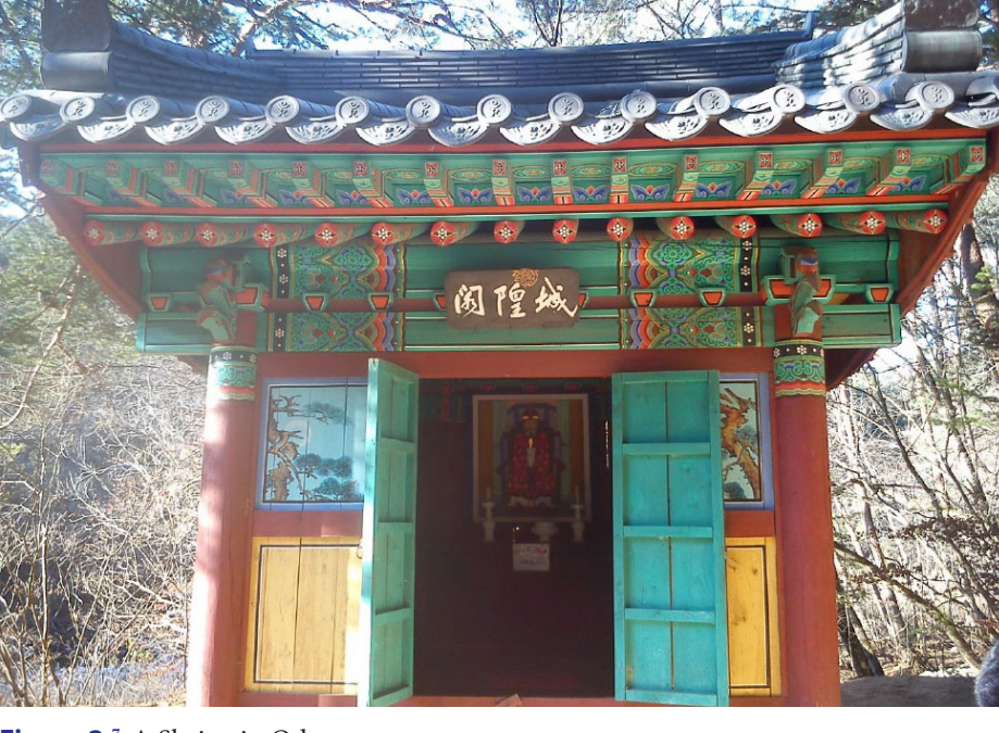
Figure 2.7 A Shrine in Odaesan

1,563m. Friendly hiking trails will take about 3-5 hours for a round trip. On the way, visitors will pass several peaks, namely Durobong, Dongdaesan and Sogeumgang. Visitors can also easily visit the Sangwonsa Temple, about 20 minutes by car from Woljeongsa.<sup>4</sup>