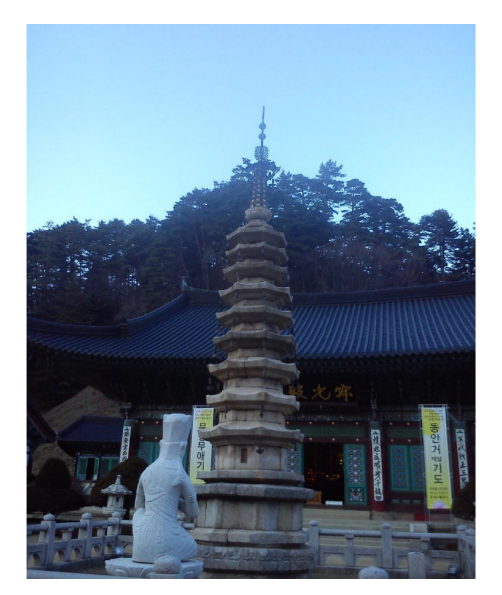
Figure 4.9 Octagonal nine-story Stone Pagoda (National Treasure No. 48).