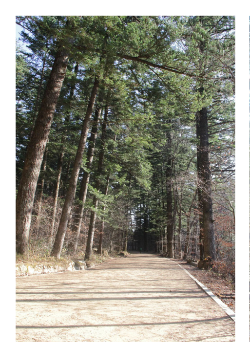
Figure 1. Trail in the middle of fir forest to explore Odaesan National Park.<sup>2</sup>