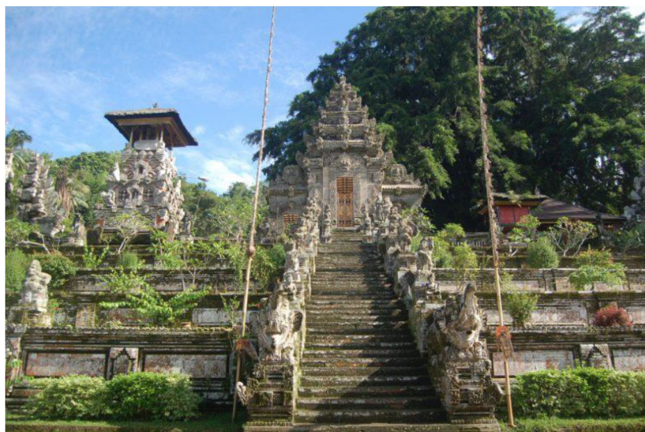
Figure 3. 17 The Iconic main gate of the temple Candi Kurung .