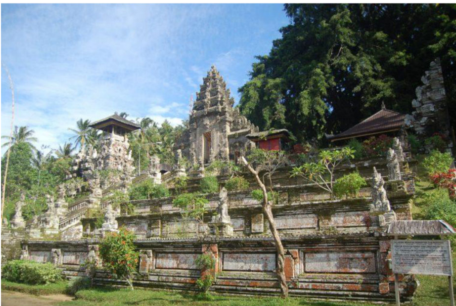
Figure 1. 4 Kehen Temple.

Besides referring to the temple as its name, Kehen, sometimes the locals associated the temple with its other name, Hyang Api Temple. The word Kehen is thought to have come from the word Keren (place of fire). When associated with the first inscription in Sanskrit, it mentions the words Hyang Api, Hyang Karimana, Hyang Tanda and the names of monks. Kehen Temple presumably existed at the end of the IX century or the beginning of the X century AD. From the data of the inscription, it is possible to see that the Hyang Api in the first inscription changed its name to Hyang Kehen. In inscription III, where Kehen might be originated from the word Keren, a synonym for brazier or place of fire. The name Hyang Api is contained in the first inscription, then became Hyang Kehen in the third inscription and subsequently became Kehen temple. The finding presumably means that Kehen Temple existed in the Saka year between 804-836 (between AD 882-914 AD). In another word, Kehen Temple already existed at the end of the IX century or the beginning of the X century AD. The existence of Kehen Temple, which has ties to the history of Bangli Village,