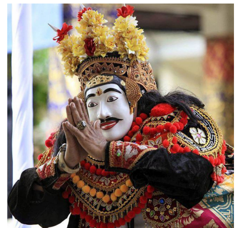
Figure 1. 4 Kakawin Niti Sastra shows the nature of how a human being must act in his social life.

Kekawin Niti Sastra, which was composed based on the contents of the Niti Sastra Book during the development of Hinduism