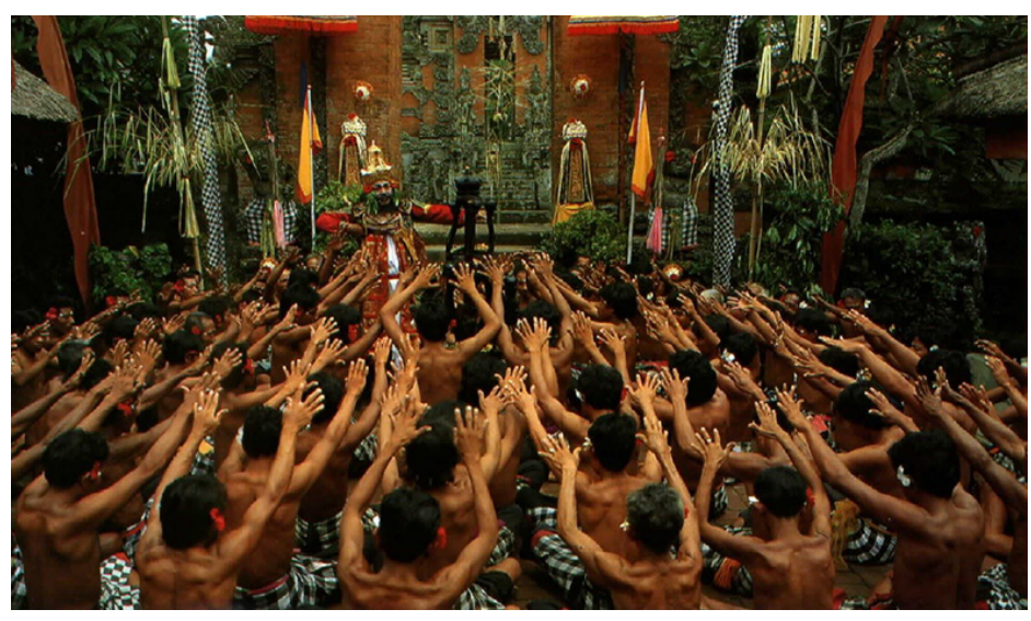
Figure 1. The Kecak dance, born out of creative cultural expression, became a unique art form showcased specifically for tourists.<sup>4</sup>

Examining the costumes from a symbolic perspective, the Kecak dance attire carries