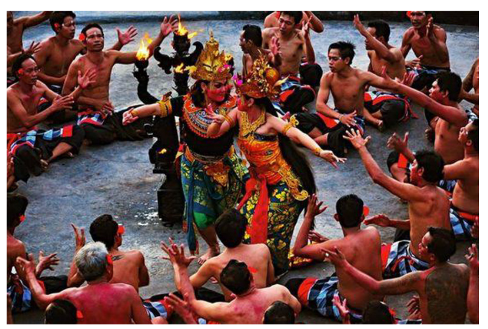
Figure 2. The Kecak dance, particularly known for its Ramayana stories, meaningful movements, and distinctive costumes, communicates non-verbally through facial expressions, spatial arrangements, timing, movements, and costumes. 12

Transcendental communication refers to communication or interaction with the spiritual world or higher dimensions. Kecak dance performances. transcendental communication usually occurs through movements, sounds, and rhythms produced by the dancers and the male choir sitting in a circle. They create the repetitive rhythmic sound "cak" that depicts the epic story of Ramayana. During the performance, dancers and the male choir create an atmosphere that connects the human world with the spiritual world. In certain scenes, dancers take on the roles of mythological characters such as Rama, Sita, or Hanuman. Through powerful and expressive dance movements, they communicate with these characters and the spiritual entities they represent. In specific moments, dancers may also experience trance or transcendence, entering a