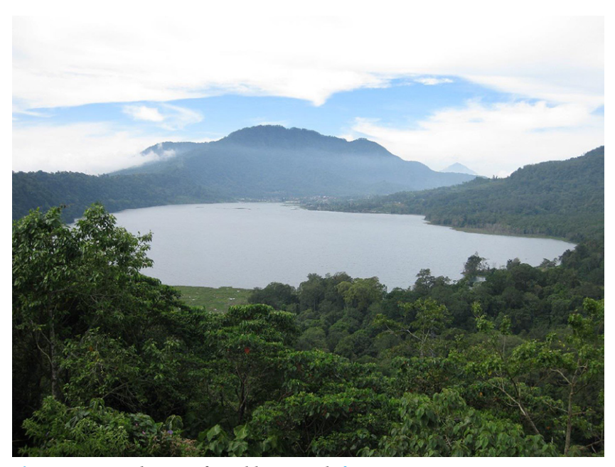
Figure 1. Aerial View of Tamblingan Lake<sup>3</sup>