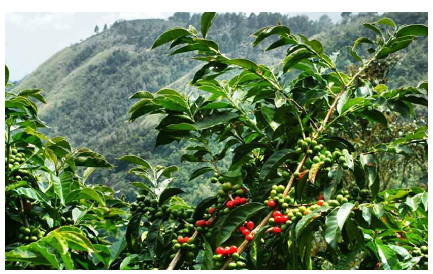
Figure 4. Coffee Plantation<sup>13</sup>