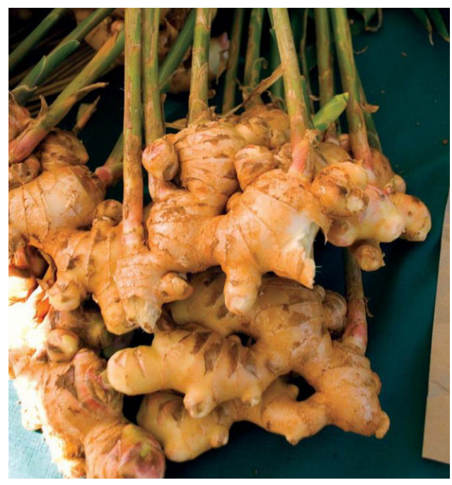
Figure 3. Member of Zingiberaceae's family, Ginger, a typical plant that grows in Tamblingan forests.<sup>9</sup>

Likewise, Buleleng regent realized the byproduct possibilities of promoting new tourism object is land conversion. Tourist area status often invites high-scale business investors to erect supporting facilities around the site, which can adversely affect the lake habitat's sustainability.